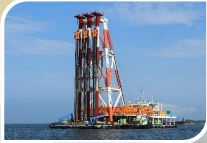
Deep Cement Mixing Barge