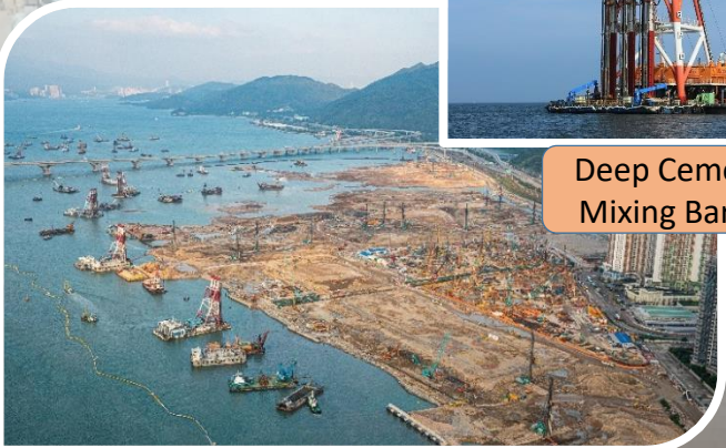
Environmentally Friendly Non-Dredged Reclamation