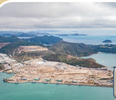
Public Fill Reception Facility